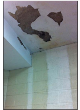
Dripping and peeling ceilings at the middle school.