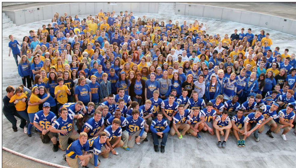
SpiritDay Grades 9-12, a victorious football game and an awesome homecoming dance attended by over 500 students/dates. Student attendance at all our sporting events has been up this year.