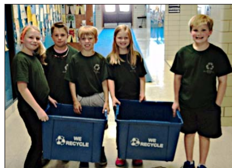
Erwine's Environmental Club

The fifth graders have been working on the website SUMDOG. This website is an interactive website for the students to practice many different math skills. The students log on and can play against their classmates or against any other student in the world. Erwine has been ranked in the top 50 schools during the national competition.