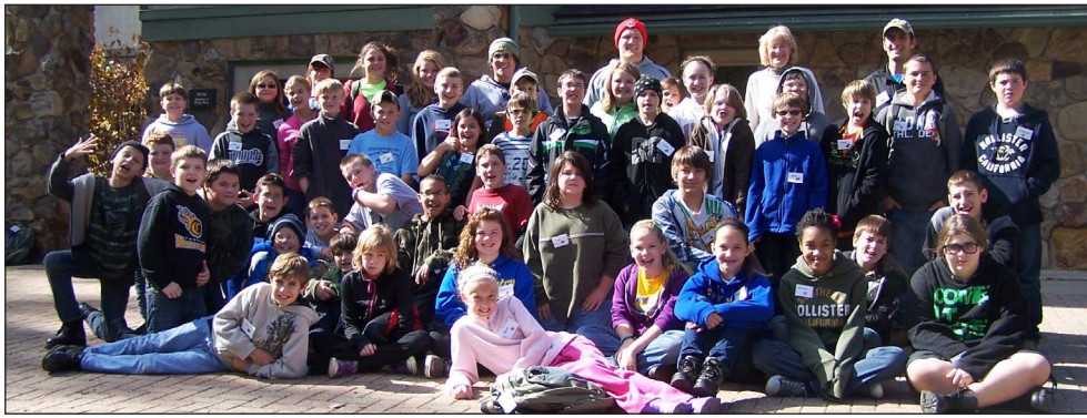
6th grade students visit Cuyahoga Valley Park