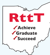
The American Recovery and Reinvestment Act, Race to the Top Fund

Through the Race to the Top program, Coventry Local Schools has worked to establish and implement innovative approaches that are transforming the educational conditions that directly impact and improve student achievement.