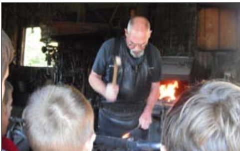
HaleFarm 3rd graders watch and listen intently to the "Blacksmith" from Hale Farm and Village!

The 3rd grade students visited Hale Farm & Village on Oct. 4th. During their visit, students experience life in the mid 1800s including a one-room schoolhouse, a first settlement log cabin, a blacksmith, how wool is sheared from sheep and spun into yarn, churning milk into butter, and glassblowing.